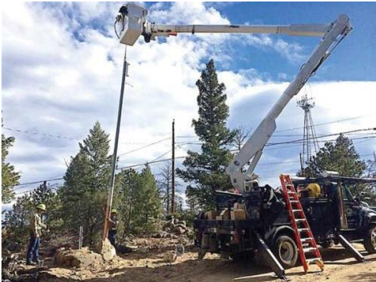
A crew from Estes Park Light and Power installs the AM radio antenna on Nov. 7, the first step to establishing an emergency radio station by January, 2015.

Estes Park is moving closer going "on the air" with a local AM radio station that is scheduled to go live in January 2015. Status of the project was updated during last Thursday's public safety committee meeting. Commander Eric Rose gave a presentation on the installation of an AM antenna on Prospect Mountain, the first step to establishing an emergency radio station which was made possible by the recent 1% local sales tax increase.